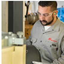
Field Overhaul Services