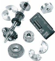
MSG® TURBO-AIR® Centrifugal Compressor Replacement Parts