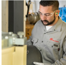
Field Overhaul Services